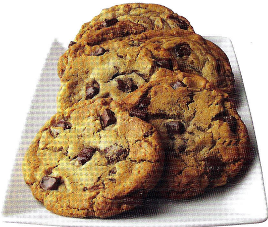
Chocolate Chunk #07-7000 $16.00 or 1 eCoupon