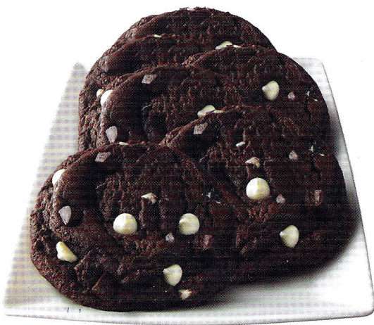
Triple Chocolate #07-7000 $16.00 or 1 eCoupon