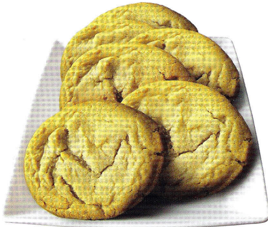
Snickerdoodle #07-7000 $16.00 or 1 eCoupon