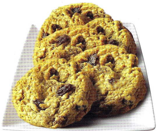
Oatmeal Raisin #07-7000 $16.00 or 1 eCoupon