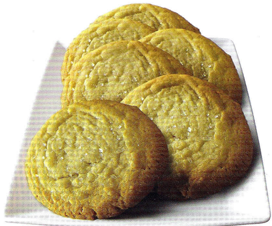
Sugar #07-7000 $16.00 or 1 eCoupon