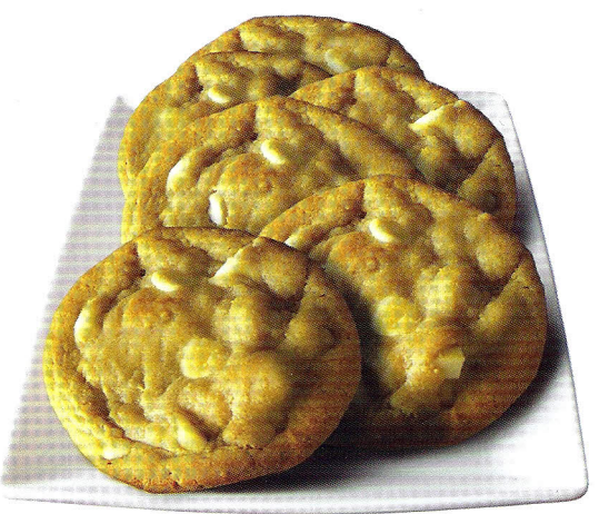
White Chocolate Macadamia Nut #07-7000 $16.00 or 1 eCoupon